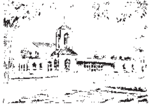
Our Lady of the Lake 129 Metro Road North, Keswick, ON L4P 3C8 Office: 905-476-0097 Fax: 905-476-0897